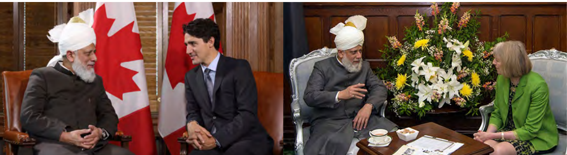
Rt Hon. Justin Trudeau MP, Prime Minister of Canada

"It is my hope and prayer that all those who value humanity understand the grave situation the world is facing work towards bringing mankind together and developing true peace in the world. Certainly, politicians and people of influence should endeavour to persuade their governments to focus on peace-building efforts, rather than inflaming conflicts and taking us further towards the abyss. At this time, the world must focus on reconciliation and bringing people together." (18 April 2017: Raunheim, Germany.)