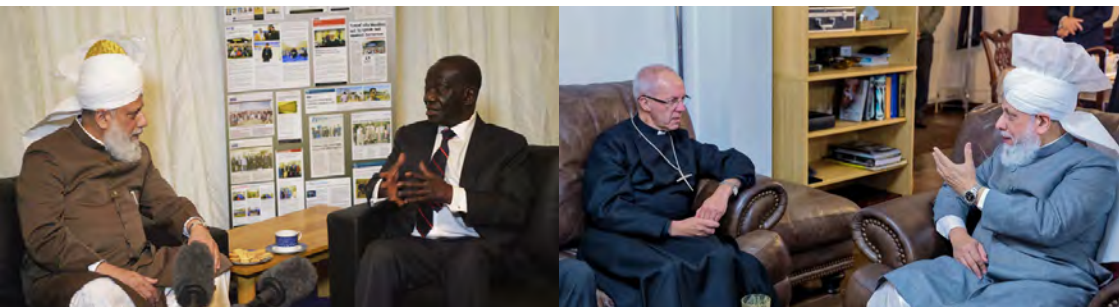
H.E. Mr. Edward Ssekendi Vice-President of Uganda

His Holiness has travelled globally to promote dialogue and understanding. He regularly meets presidents, prime ministers, other heads of state, parliamentarians and ambassadors of state.